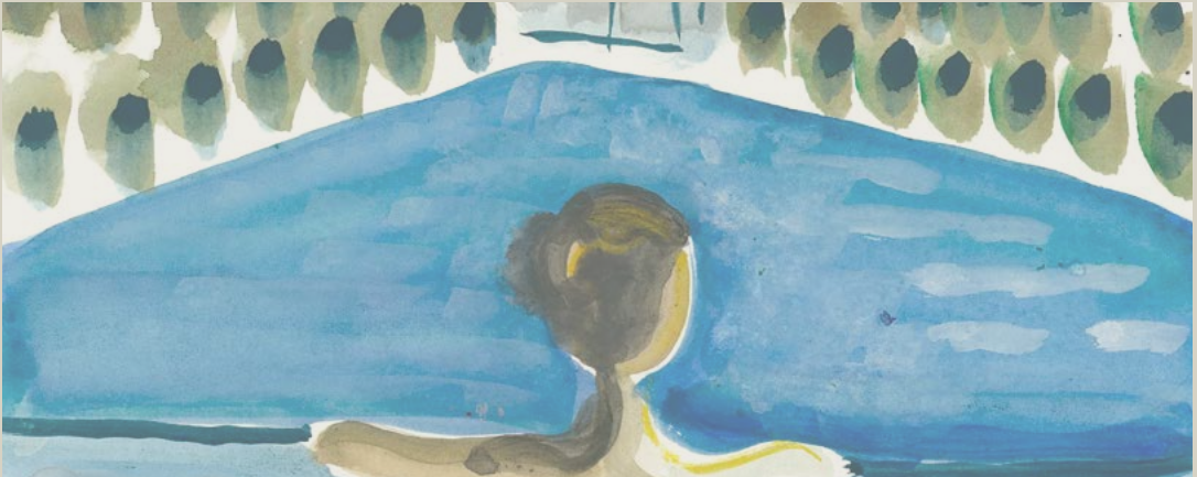
Inspired by the lake, watercolour by Matteo Thun

Together with his studio team – Matteo Thun & Partners, based out of Milan and Munich and known for its ecological sensitivity and greater consciousness in design – Matteo designed around the natural light that he welcomed into the space with high-intensity, creating dramatic shadows throughout as the sun shifts. He respectfully selected natural materials such as stone and sustainably-sourced Canadian wood, which forms impressive high-rise beams running along the entirety of the interior ceiling, and which will gently patina over time. The chosen palette is earth-toned and organic; wild native fauna will envelop the roof; the contemporary structure meticulously