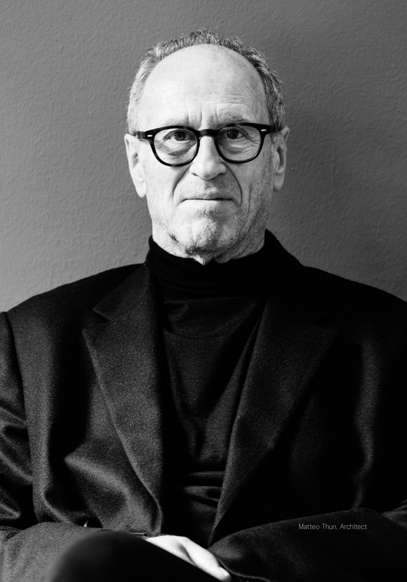
Matteo Thun, Architect