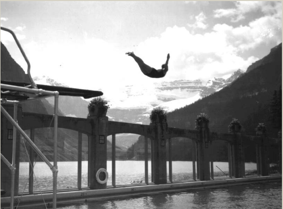
NA71-4910 Open-air swimming pool on the shores of Lake Louise

In 2025, the luxury of lakeside bathing returns to Chateau Lake Louise, with the introduction of BASIN Glacial Waters. Resting on the exact location of the original open-air pool, BASIN represents the contemporary redesign of the outdoor bath experience, imagined for the modern-day wellness seeker.